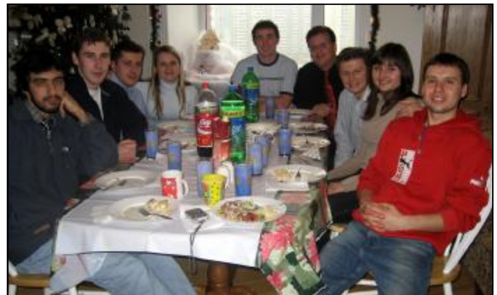
Our fourth year students in our apartment for a Christmas party.

We were blessed to have 11 freshmen start this year as youth ministry students bringing our total to 35! I have been concentrating on equipping my seniors to teach this past semester since they will be graduating soon. Our last class, Professional Orientation to Youth Ministry, teaches them Biblical leadership principles and practical skills such as writing a resume. I had each of the seniors teach part of my freshmen class on "Principles of Youth Ministry" as well. They really did a great job of teaching, and I know that some of them will be Youth Ministry Professors some day. My goal is to replace myself and move from my position as a "teacher" to the position as a "coach." Another part of their class was to prepare a personal portfolio and be interviewed before a panel. We had the mock interviews last week. We pretended that they were applying to be the youth ministry professor at Chernobyl Bible Institute. We tried to ask them tough and personal questions so they will be prepared for anything. I am very proud of my six seniors who will be graduating on May 26th. And we will be celebrating something else at their graduation too - that we will have completed the translation of all twelve college-level youth ministry courses!