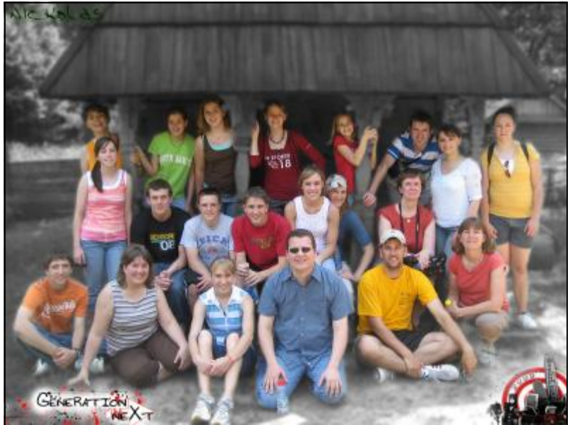
South Dakota Summer 2008 Team to Ukraine

In the night programs, the campers heard about different vices that entangle a person, but they also heard how to find freedom. They heard about Jesus Christ, our Savior, who humbled Himself before all of HIS creation and died so their sins could be forgiven. There were two nights where kids had an opportunity to repent. Around 24 of them made the decision to give their lives to Christ. I have been completely changed by this experience. I realized that it wasn’t just the words that had such a big affect on the kids. Throughout the week, the campers understood that we truly loved them. Many of them saw through the love; they saw that it actually wasn’t our love but Christ’s! It is such an encouragement to see what living a life for Christ can do. A verse popped up at least twice in the time we were there, and I think it spells out why these results occurred. Colossians 3:17, “Whatever you do, whether in word or deed, do it all in the name of the Lord Jesus, giving thanks to God the Father through Him.” God worked in this camp! All we did was glorify Him with our actions.